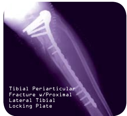
Tibial Periarticular Fracture w/Proximal Lateral Tibial Locking Plate