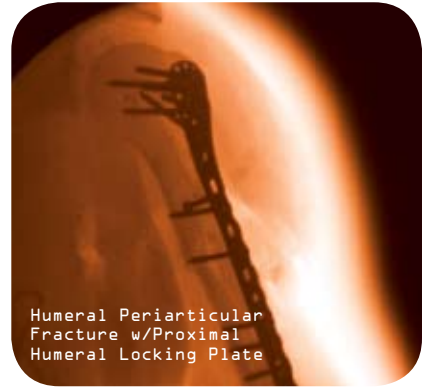
Humeral Periarticular Fracture w/Proximal Humeral Locking Plate